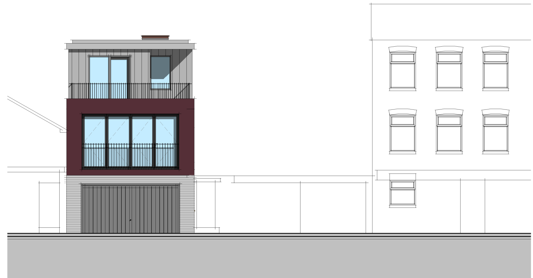
Proposed Front Elevation 1 : 100