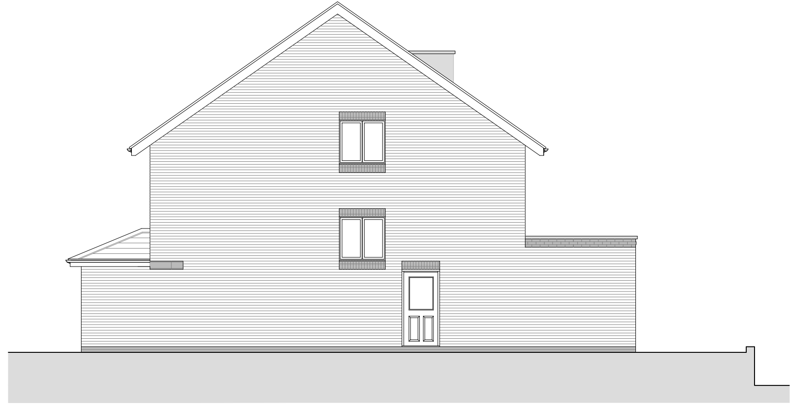
SIDE ELEVATION PLOT 1