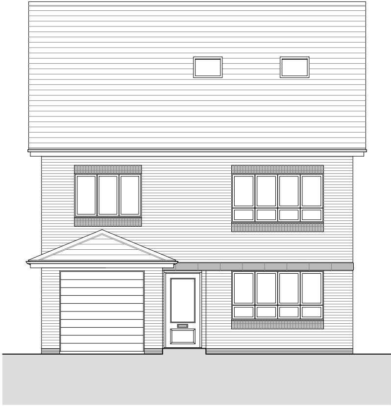
FRONT ELEVATION PLOT 1