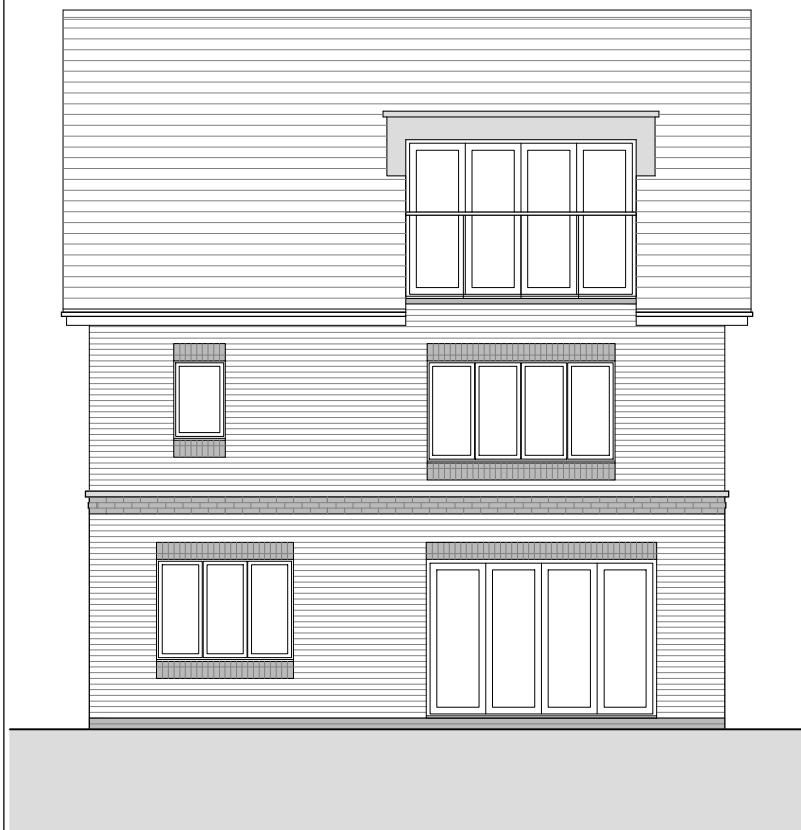
REAR ELEVATION PLOT 2