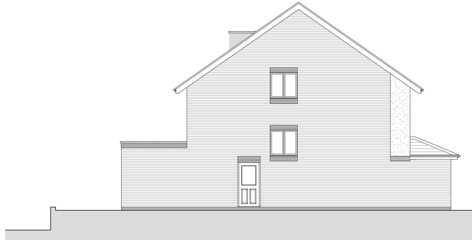
SIDE ELEVATION PLOT 2