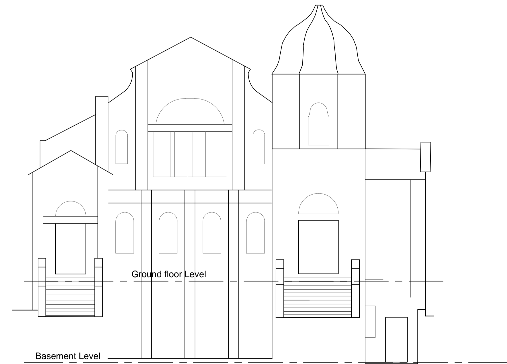
Existing Side Elevation (Salisbury) Scale 1:100