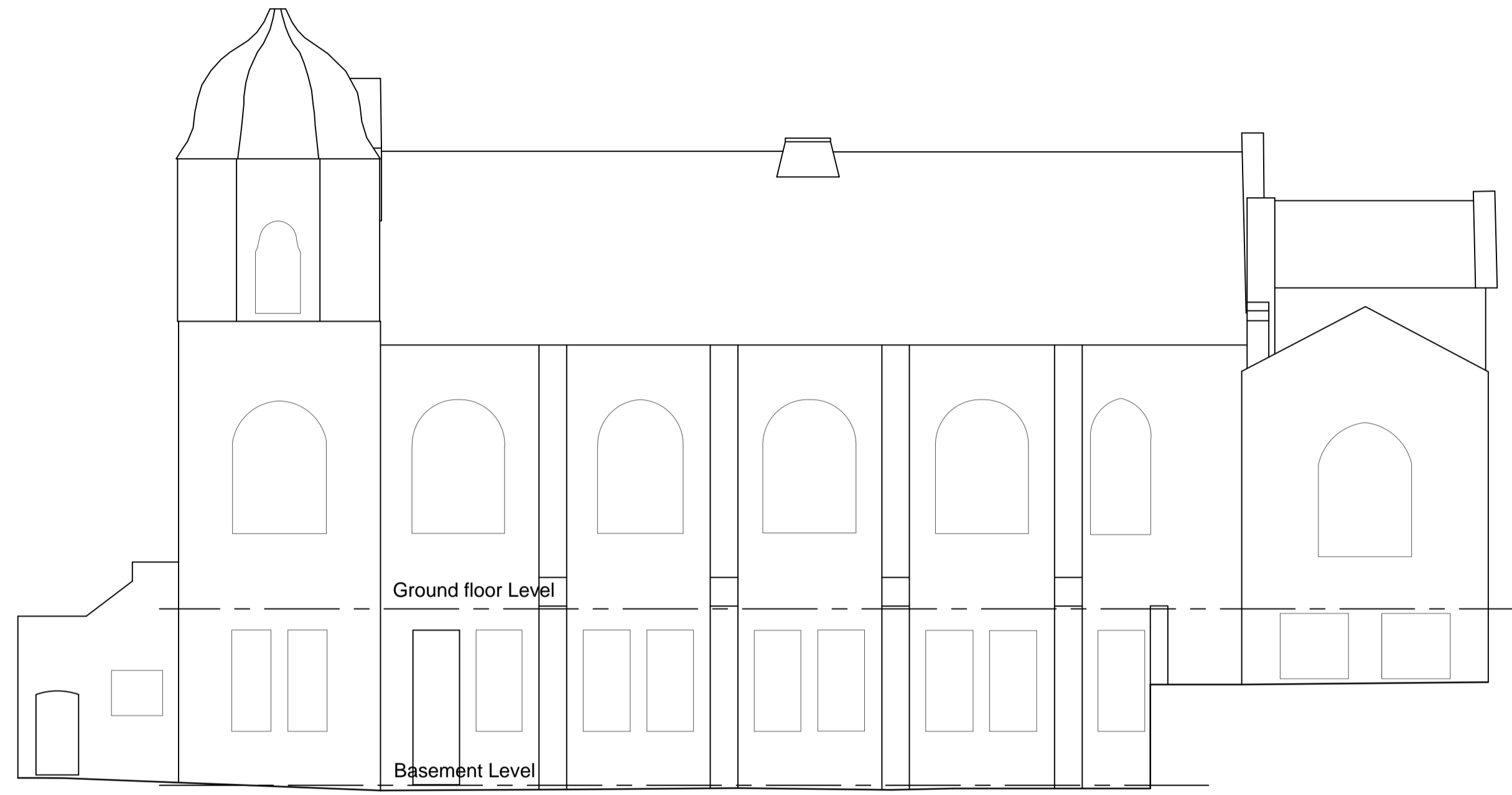
Existing Front Elevation (Lawrence Road) Scale 1:100