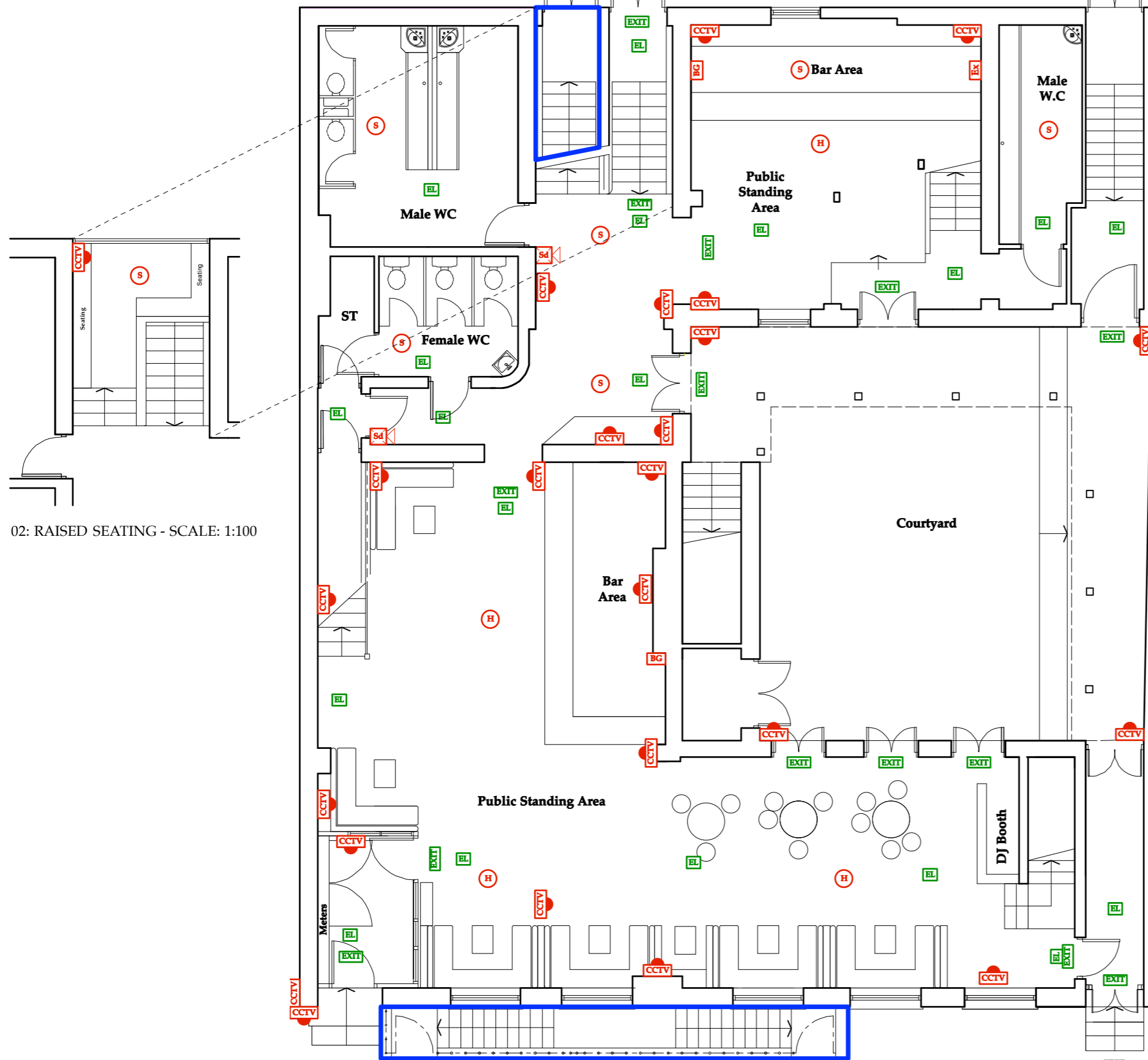
02: RAISED SEATING - SCALE: 1:100